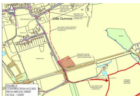
Figure A: Construction Access from Brook Street

The report does suggest that the final solution may involve both Baynards Avenue and Brook Street.